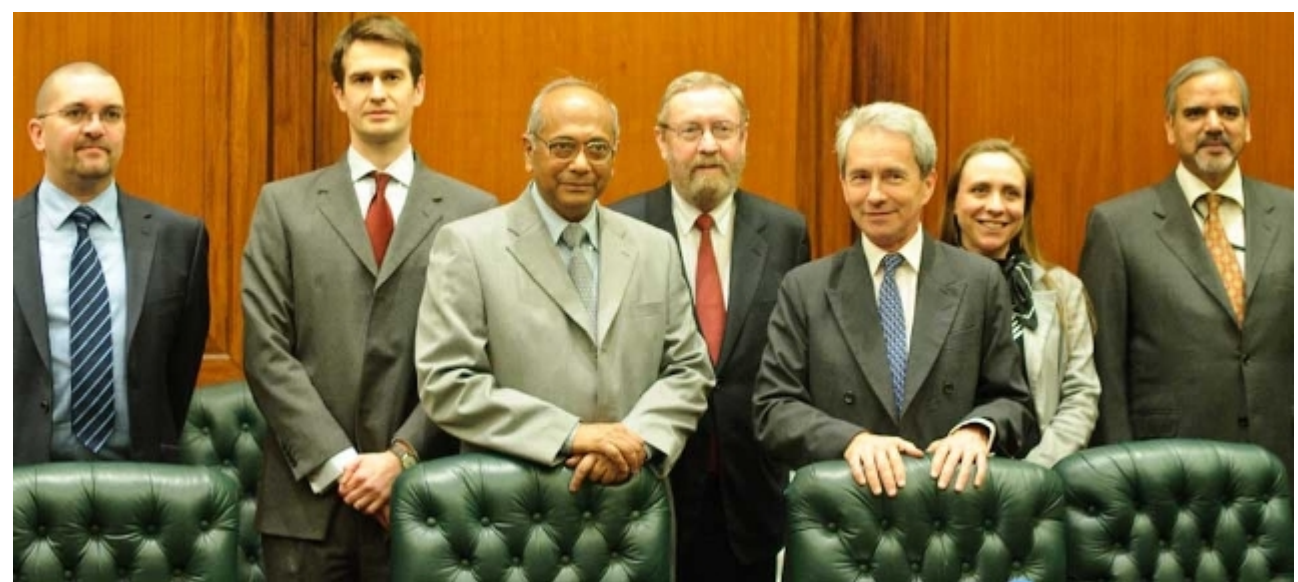
Above: Signing of the Civil Nuclear Co-operation Declaration, 11/2/2010, New Delhi

The GCSA moderated the biennial UK-India Science and Innovation Council with his Indian counterpart in New Delhi. This Ministerial-level meeting provided an opportunity for the UK and India to agree the direction of bilateral science and innovation collaboration for the next two years. Highlights of the 2010 Council included the agreement of jointly funded research projects worth £70 million in areas including energy, food security, water and health, as well as increased engagement on innovation, a renewed focus on basic science including mathematics and computer science, and improving the mobility of young scientists.