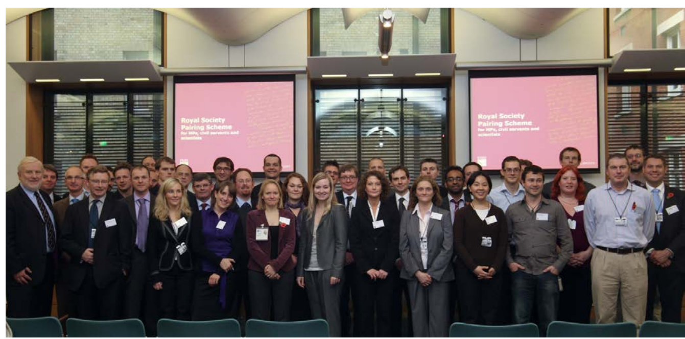
Above: delegates at Royal Society Pairing Scheme launch