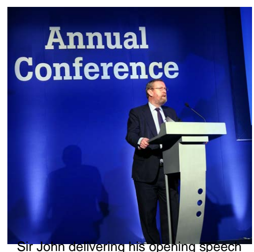
at 2010 GSE Annual Conference

On each occasion, scientists and engineers from across government departments gathered to hear presentations from the GCSA, Government Ministers and high-profile speakers from industry, academia and across the Civil Service. They also took part in breakout sessions covering, in 2010 for example, issues such as the impact of the Oyster card on