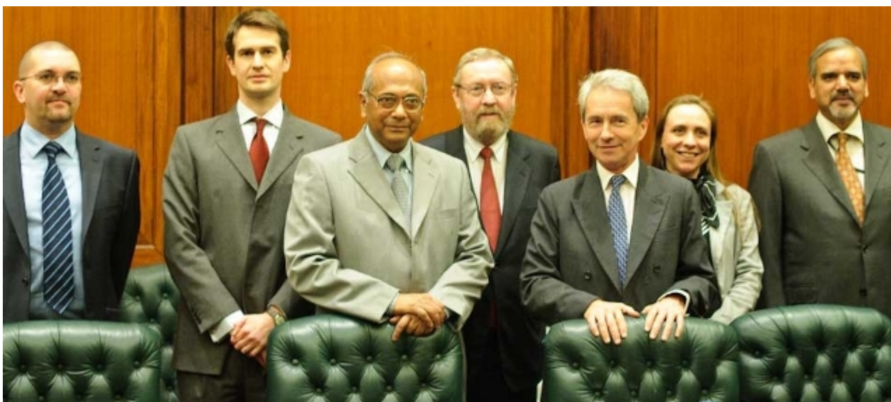
Above: Signing of the Civil Nuclear Co-operation Declaration, 11/2/2010, New Delhi

The GCSA moderated the biennial UK-India Science and Innovation Council with his Indian counterpart in New Delhi. This Ministerial-level meeting provided an opportunity for the UK and India to agree the direction of bilateral science and innovation collaboration for the next two years. Highlights of the 2010 Council included the agreement of jointly funded research projects worth £70 million in areas including energy, food security, water and health, as well as increased engagement on innovation, a renewed focus on basic science including mathematics and computer science, and improving the mobility of young scientists.