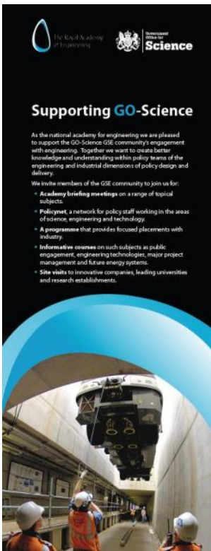
Left: RAEng flyer