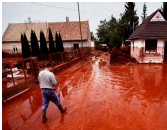
Damage caused by alkaline waste spill in Hungary, November 2010

Following the spill of alkaline waste after a dam collapsed at an aluminium processing plant in Hungary, the Prime Minister promised his Hungarian counterpart the UK's assistance. The GCSA organised for a delegation of leading experts from the British Geological Survey and Newcastle University to visit the site and help assess the impacts of the spill including how vulnerability to future spills could be reduced. The contribution from UK science to addressing the problem was recognised as extremely valuable by the Hungarian Government.