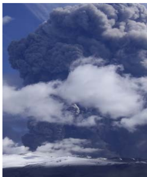
Right: Eyjafjallajökull volcanic ash

SAGE members included independent and government experts, CSAs from several government departments and a representative from the Civil Aviation Authority. SAGE met four times between 21 April and 24 June 2010.