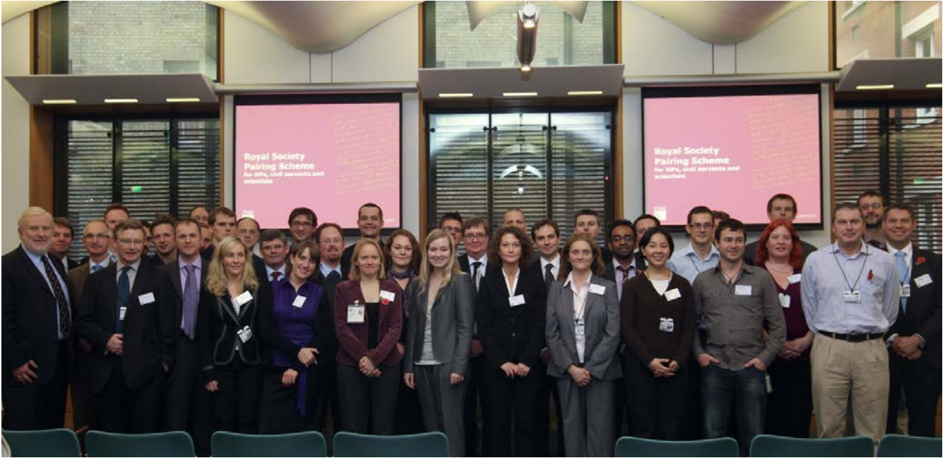
Above: delegates at Royal Society Pairing Scheme launch